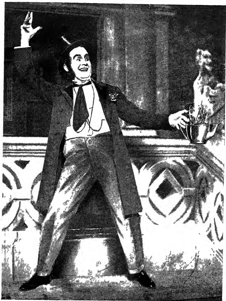
J W. WELLS IN "THE SORCERER" I DO SOME SORCERISING